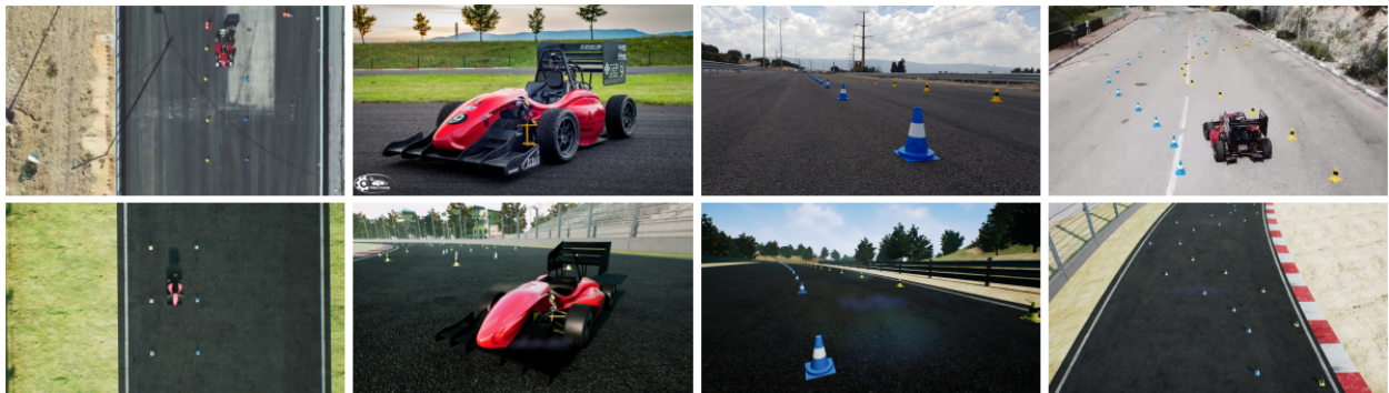
Images taken from the simulated environment (bottom) and from real tracks (top).